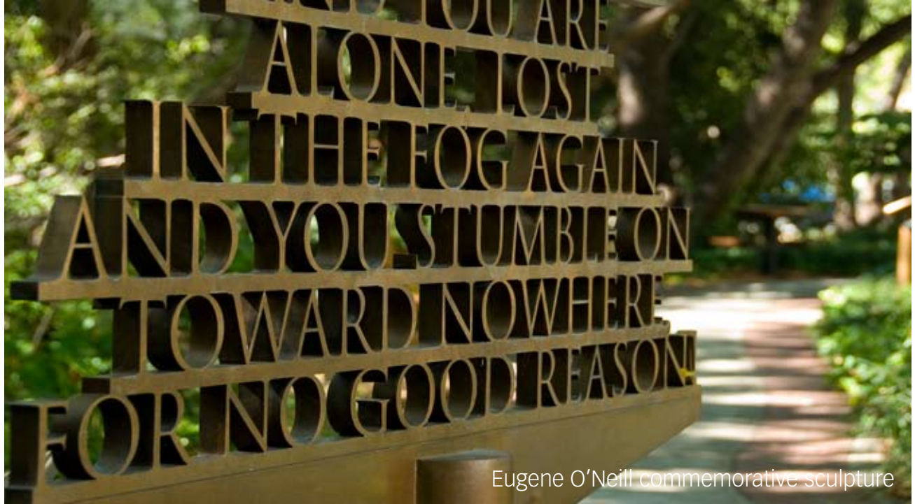
Eugene O'Neill commemorative sculpture